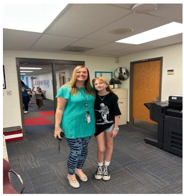
Lottie M. Schmidt Elementary School is considered a Title I building. This federal classification provides additional funding and programs to benefit our students.