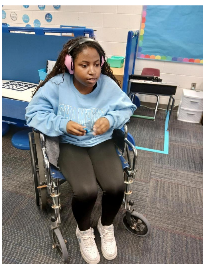
Lottie M. Schmidt Elementary School is considered a Title I building. This federal classification provides additional funding and programs to benefit our students.