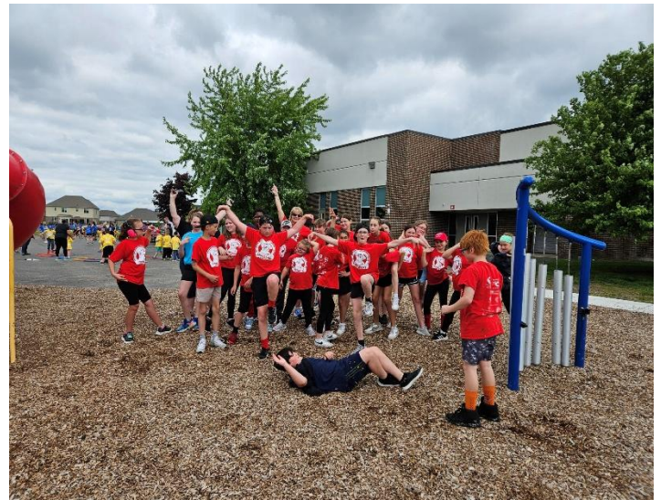
Lottie M. Schmidt Elementary School is considered a Title I building. This federal classification provides additional funding and programs to benefit our students.