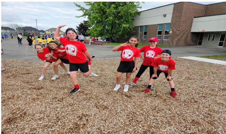
Lottie M. Schmidt Elementary School is considered a Title I building. This federal classification provides additional funding and programs to benefit our students.